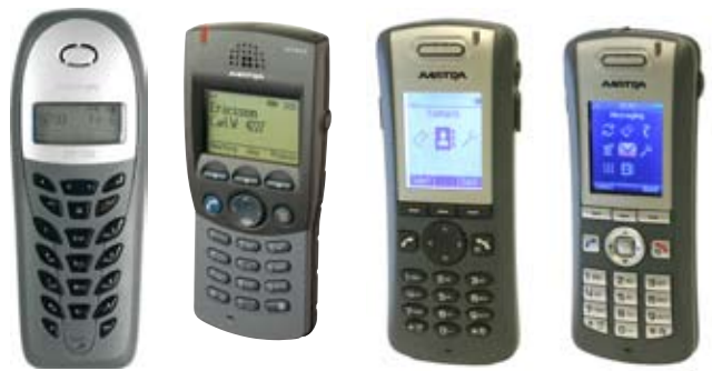
DT190, DT 292, DT 4x2, DT590, DT390 and the DT690

DT390 is a simple phone with modern design, this is the choice for the pure office environment.